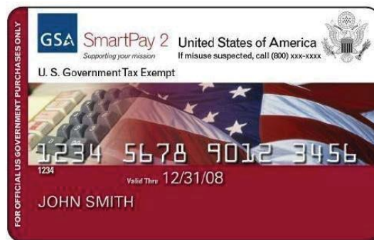
Purchase Card – Not Taxable