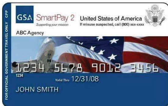
Travel Card – may or may not be taxable (see text)