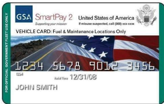
Fleet Card – Not Taxable